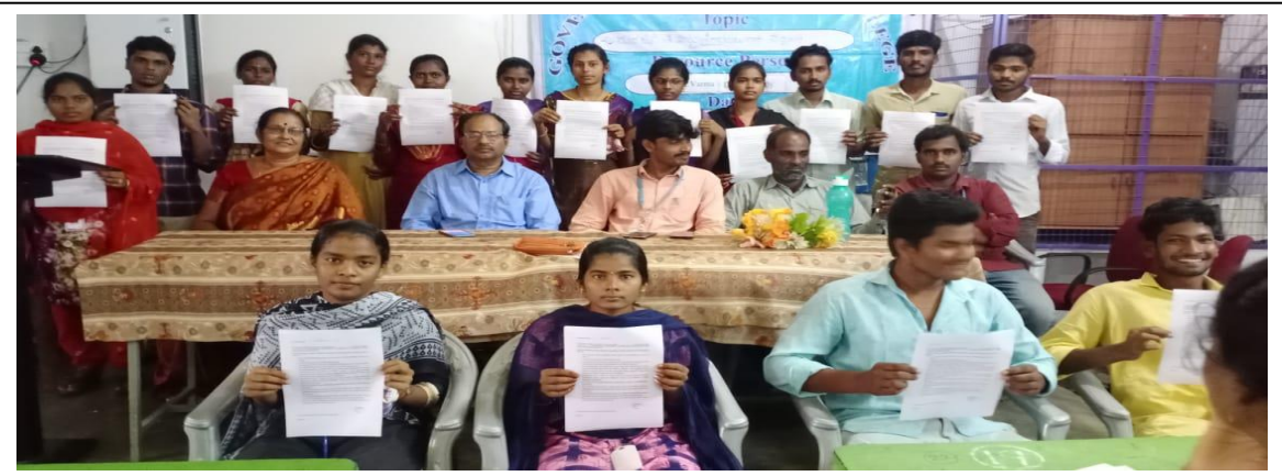
Our students who got placed during the placement drive 2018-19

During the academic year 2018-19, we invited ICICI-BANK-TVS-TS and VICTORY HUMANRESOURCE CONSULTANT to organize placement drives in our campus. 20 of our students secured jobs