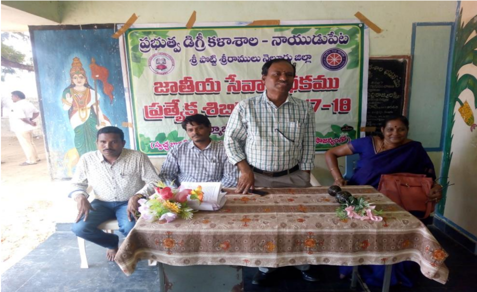
NSS Special Camp was conducted in Thimmaji Kandriga from 15-03-2018 to 21-03-2018.