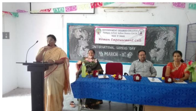
Women's Empowerment Cell Activities