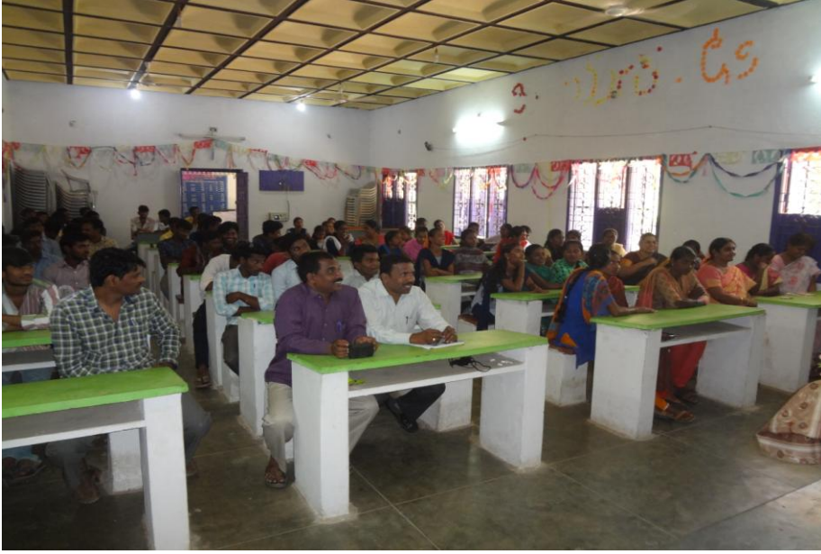
Celebrated International Mother Tongue Day on 21-02-2018 by Dept. Of Telugu.