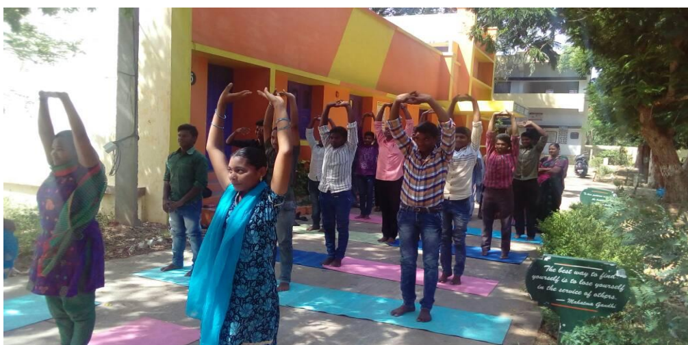
Celebration of International Yoga Day on 21-6-2017.