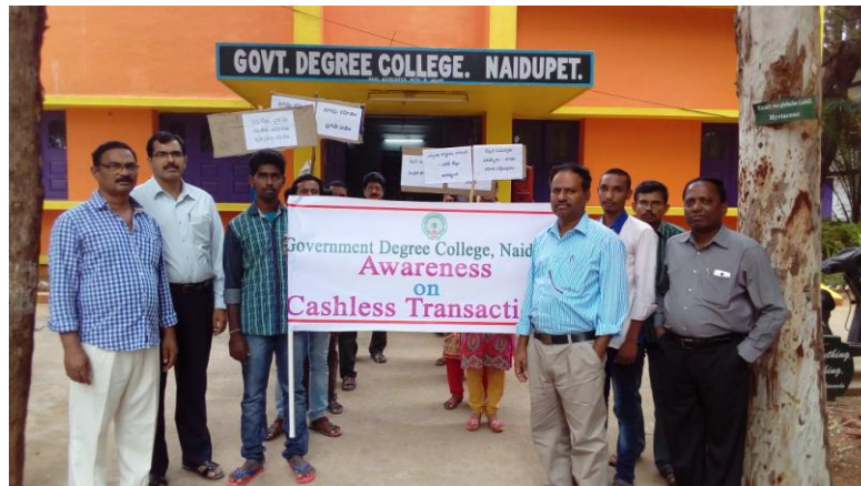
Awareness on Cashless Transactions