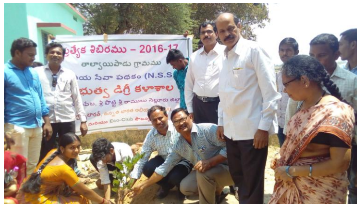
NSS Special Camp Activities