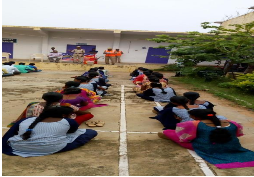
Awareness on emergency by Fire Service department