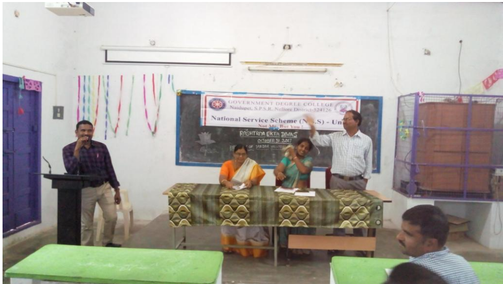
Celebration of Rashtriya Ektha Diwas on 31-10-2017.